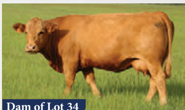
Dam of Lot 34

258K is moderate, deep sided and proud fronted. We retained our 34G herd sire based on his cherry red colour, great performance, and his dams record of good uddered and structurally sound, correct daughters. The dam of Lot 28 happens to be a sister to 34G.