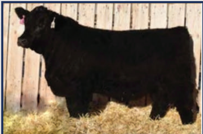
Circle G Explorer 40E

A bull purchased from Circle G based on his performance blended with great CE, BW and MCE numbers, and his dam's quality and productivity. The Zeola 204Z cow had another excellent son in Garth's sale this year and that is just the type of longevity and production we want to replicate. We have been very pleased with 40E's calves. They are thick made, well muscled and some of the heaviest steers come fall were sired by "Explorer." The foot structure, udder quality and milk production of his daughters is absolutely ideal. We are very pleased with their phenotype and feel that they will mature to be a backbone in the Black Simmental division.