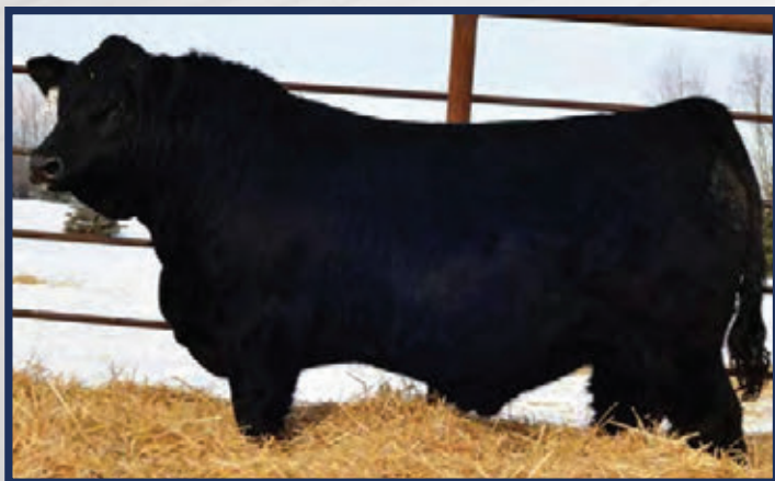
Erixon State of War 207F

A bull purchased from Circle G based on his performance blended with great CE, BW and MCE numbers, and his dam's quality and productivity. The Zeola 204Z cow had another excellent son in Garth's sale this year and that is just the type of longevity and production we want to replicate. We have been very pleased with 40E's calves. They are thick made, well muscled and some of the heaviest steers come fall were sired by "Explorer." The foot structure, udder quality and milk production of his daughters is absolutely ideal. We are very pleased with their phenotype and feel that they will mature to be a backbone in the Black Simmental division.