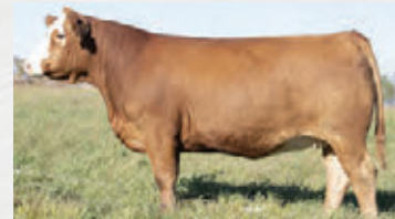
$16,000 daughter of Eastwood 22E

This is a moderate and complete herd bull which we purchased for $20,000. I'm sure he hasn't dropped an ounce of flesh since the day he got here, and that's impressive in itself considering his depth and thickness. A very complete package that is eye appealing and to no surprise calved extremely well on heifers with EPD's in the 1st percentile for CE, BW and MCE. Springcreek Simmentals bought a semen package and used him on heifers and mature cows and the resulting progeny are fantastic. His sons in the Pursuit of Perfection 2021 sale brought as much as $20,000, $18,000 and $16,000. Daughters of Eastwood 22E sold for as much as $20,000 and $16,000 in Springcreek's dispersal. We are calving the third set of 22E heifers now. They are all well balanced, moderate young brood cows that are producing very well. Eastwood improves udders, calving ease and maternal traits regardless of what he is bred to.