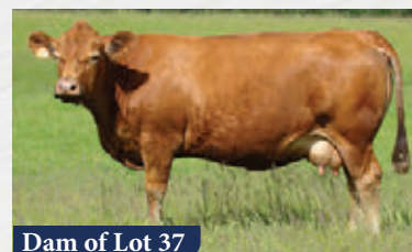
Dam of Lot 37

The dam of 271K may be non-recordable but she has a great track record here. This bull has lots of length of spine and we always find that it is length that equates to weight. He will prove useful in many programs.