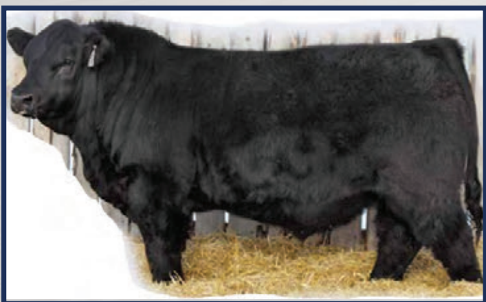
Skors Captain Morgan 195G

State of War 207F was the high selling black Simmental bull in Erixon Simmentals 2020 sale. We purchased him based on his phenomenal calving ease traits, curve bending growth and foot quality. I can't say that I ever remember having a herd sire whose calves consistently came with nearly a week early gestation. Never mind how much explosive growth they have after birth. The replacements in the pen certainly do not look like heifers' calves. It makes a huge difference to your calf crop when you can count on first calvers to raise calves that fit right in with the rest. Daughters of 207F have developed well suspended, tidy udders. They are long topped and good footed, feminine, very good mothers and their calves display great vigour.